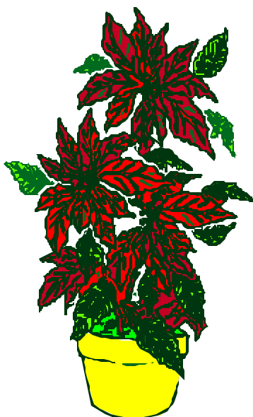
The New 'Plum Pudding' Poinsettia

urday & Sunday of Dec 7-8 and Dec 14-15 we are looking for all Poinsettia connoisseurs to take part in our Poinsettia Evaluation. For a chance to win a $10 Gift Certificate please fill out one of our evaluation forms and help us determine the preferences of our customers. The Greenhouse will have sizes of poinsettias from 4" to 14" in all the colors. The Garden Center will be filled with a great selection of fresh live wreaths, roping, swags and other